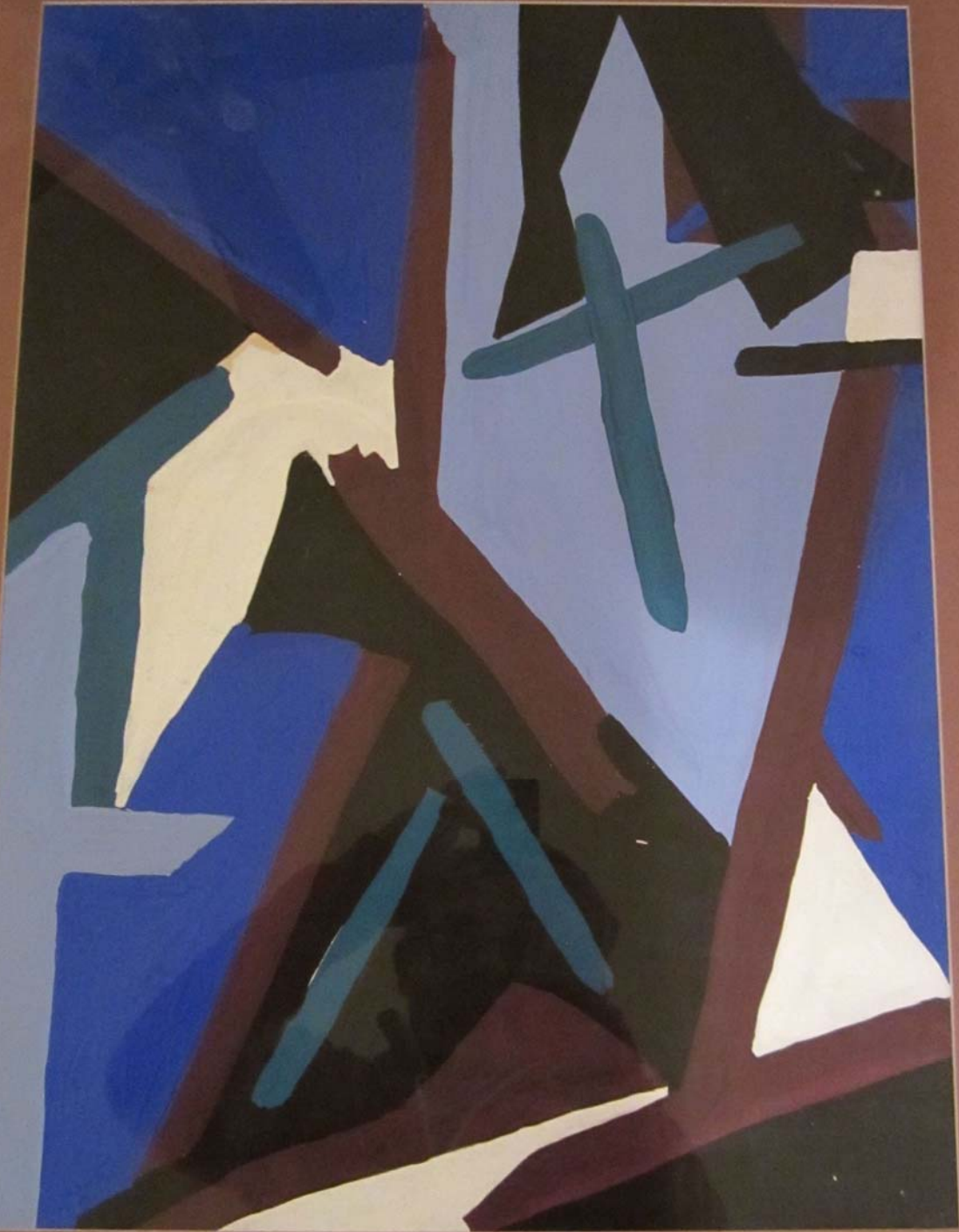
The Way of the Cross